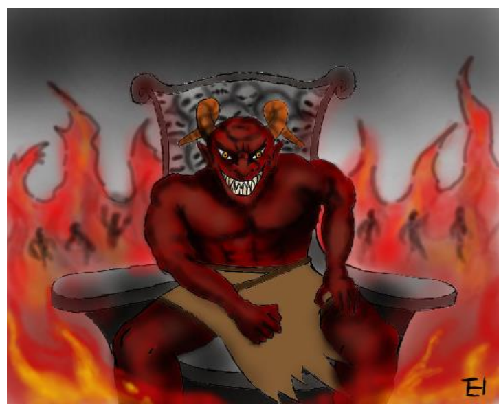
There is a cost for sin!

Yohanes 3:36 Ulun sa parisaya ma Anak yiru sagar kaiyuh pamelum sajati palus makalalawah. Kude ulun sa puang ngalut nuu ma Anak yiru puang kaiyuh pamelum. Hanye nahukum Alatalla palus makalalawah.