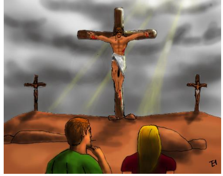
Why did Jesus die?